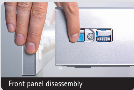
Front panel disassembly